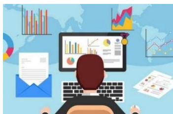
Fig. 1. Figure caption

2.4. Each figure must be signed. The caption (title) of the figure should be written: 11pt, centre (Fig. 1).